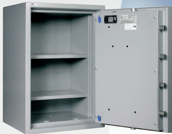
Model Dinami 412