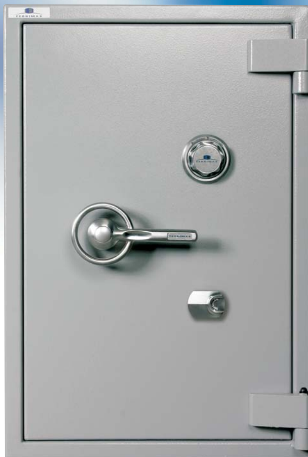
Option: combination lock

The whole manufacturing cycle from the raw materials to the final packaging are geared towards the production of the environment.